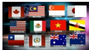
LIVE4: Trade ministers discuss TPP outcomes