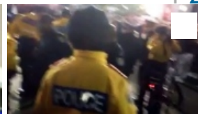
CTV Toronto: Mob taunts Toronto police