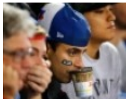
Toronto Blue Jays fight to stay in ALCS against KC Royals

Posts related to 'It was the right thing to do,' says man who put Sammy Yatim shooting video on YouTube