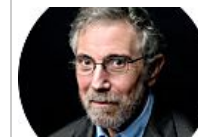
Trump Is No Accident The New York Times