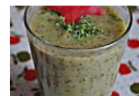
A new spin on an old mix and my gut is disappearing!