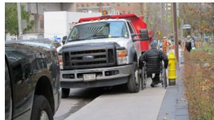
Toronto parking fines jump on Thursday