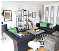
Restyle your home on a budget