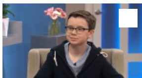
Canada AM: Opportunity of a lifetime