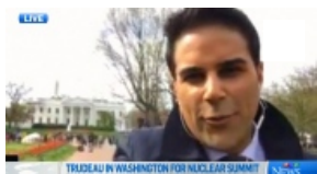
CTV News Channel: Trudeau in Washington