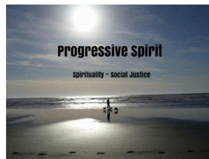
A new show every Sunday at 11 am Pacific

I Host a Weekly Radio Show and Podcast Called Progressive Spirit .