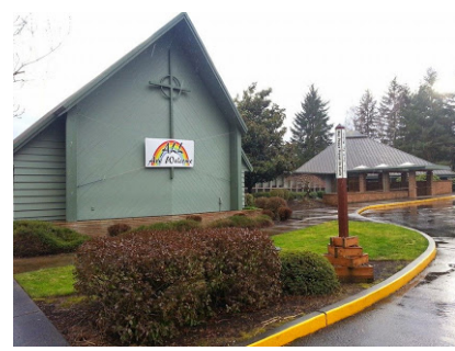
A church so cool we even get protesters!