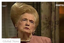
Like mother like son: Donald Trump's mom's hair grabs Internet's attention