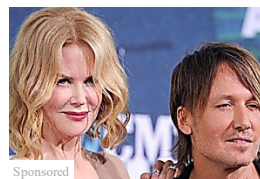
Her Revealing Dress Dropped Jaws At The CMT Music Awards