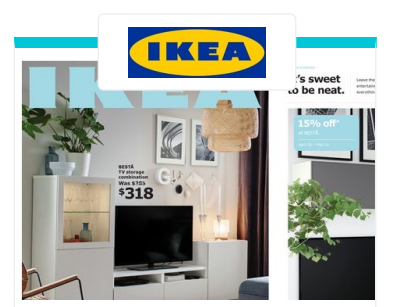
Hover for Flyer