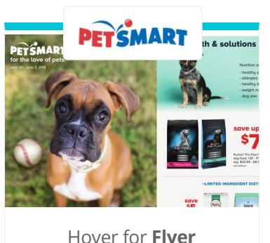
Hover for Flyer