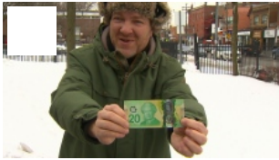
Counterfeit bills are showing up across Ontario