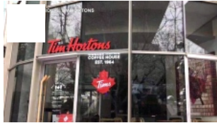
Tim Hortons opens first location in China