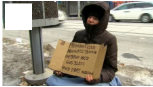
Homeless population turning to ERs for shelter