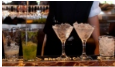
Toronto council approves proposal to allow alcohol sales earlier on weekends