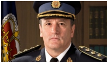
Interim OPP Commissioner Brad Blair is seen in a 2013 photo.