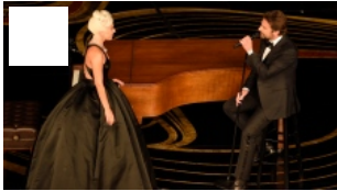
Bradley Cooper's ex-wife reacts to chemistry with Lady Gaga