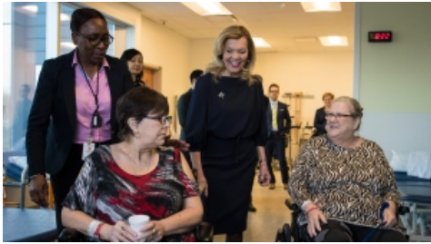
Province unveils new 'Ontario Health' super agency, co-ordinated health teams

Ontario is consolidating its local and provincial health networks to create a central agency as part of a system overhaul, the health minister announced Tuesday, though she wouldn't say if the move will save money or lead to job losses.