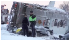
One critical, others injured after multi-car crash on Hwy. 115 near Peterborough

Ontario is consolidating its local and provincial health networks to create a central agency as part of a system overhaul, the health minister announced Tuesday, though she wouldn't say if the move will save money or lead to job losses.