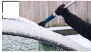
Another blast of winter this week in Toronto