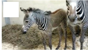
Toronto Zoo welcomes new addition to zebra family