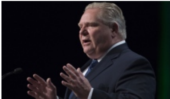
Ontario Premier Doug Ford speaks at the Rural Ontario Municipal Association conference in Toronto on Monday January 28, 2019.